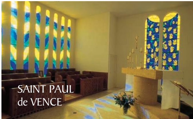
SAINT PAUL de VENCE