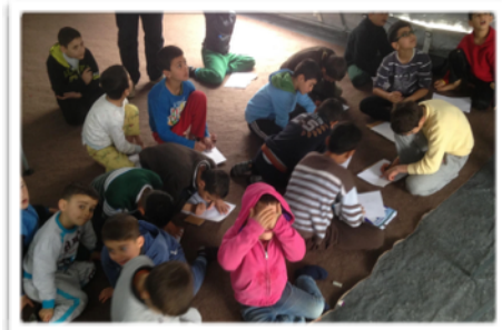
Government of Kurdistan does not have the capacity to integrate the children into school system