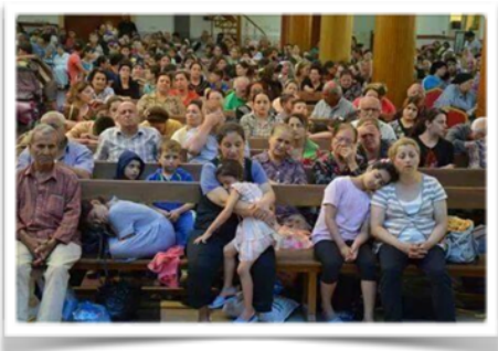
August 2014, Fleeing ISIL, Exhausted Iraqi Christians arrive in Erbil,