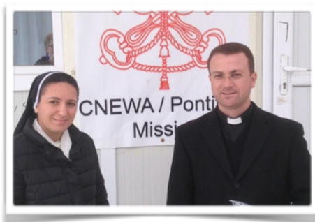
Clinic in Erbil for Refugees