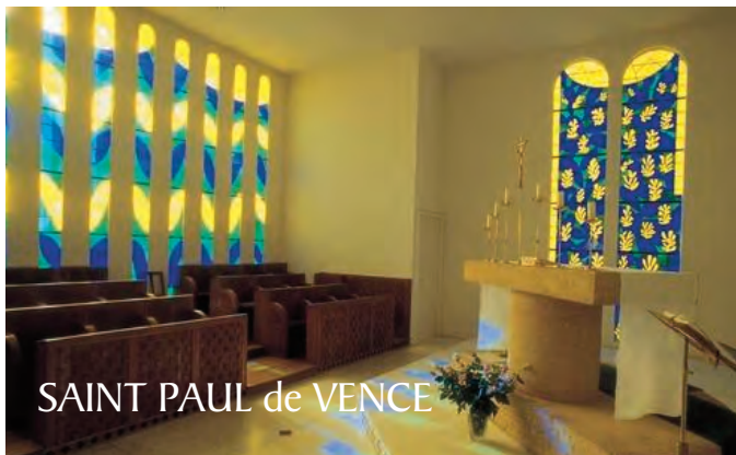
SAINT PAUL de VENCE