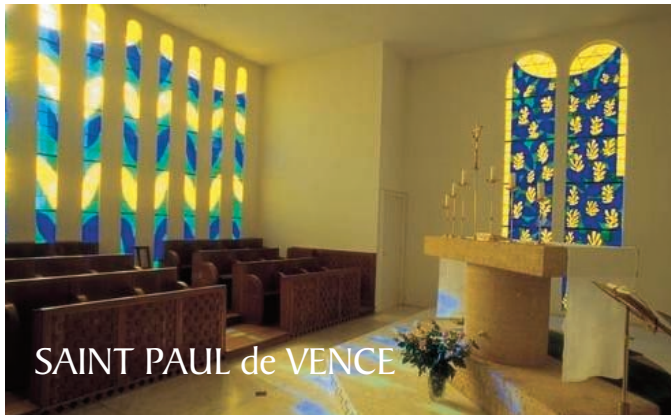
SAINT PAUL de VENCE