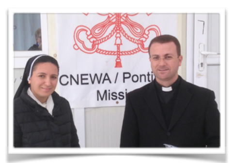
Clinic in Erbil for Refugees